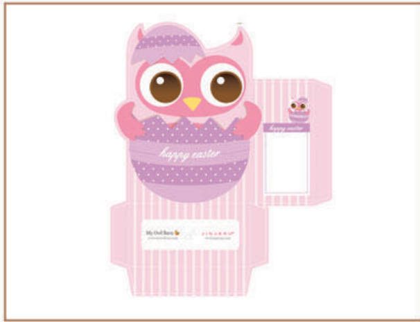
Easter Owl Goodie bag: Outer A