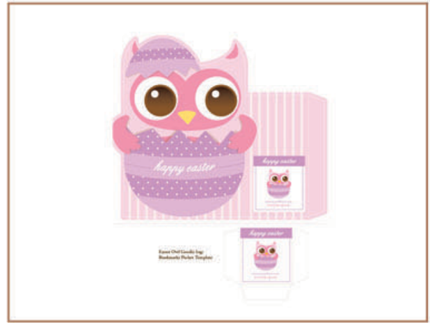
Easter Owl Goodie bag: Outer B & Bookmarks Pocket Template