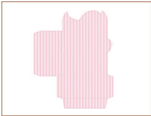
Easter Owl Goodie bag: Inner A